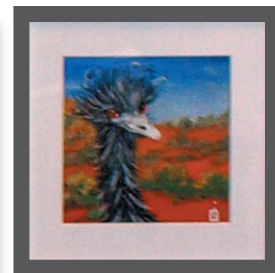
Ingrida Spole EMU.