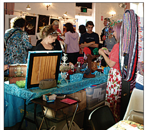
Artisan Market Stalls

Shires. With so many diverse arts and crafts happening in Wollondilly Shire it would be most rewarding to have a central space for cultural activities, displays, storage and workshops – attracting talented and knowledgeable people to share their skills with ours.