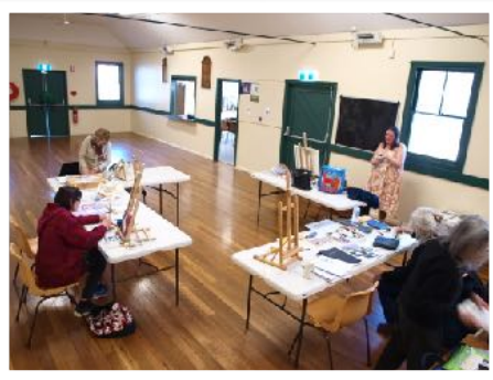
Creative Get Together at Buxton School of Arts

One way of achieving this goal is our Creative Get Togethers . We meet on the second Saturday of the month (except January), at the Historic Buxton School of Arts