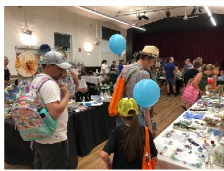
2023 Illuminate Artisan Market WSC Hall

WAG were invited to participate in the two day weekend event by Rotary and Wollondilly