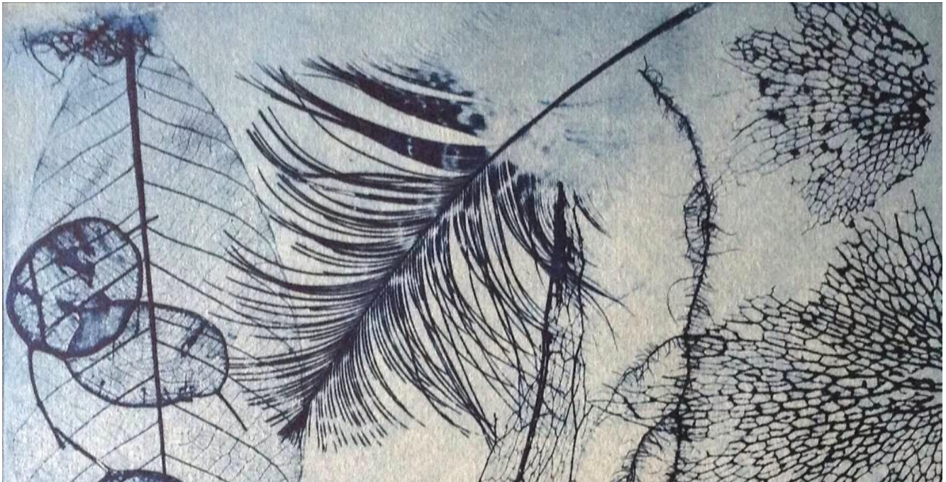
Solar/Polymer Plate Print by Elizabeth Atkin

Solar/Polymer Plate Printing Workshop with Elizabeth Atkin Sat 7th/Sun 8th October 2017 10am to 4pm